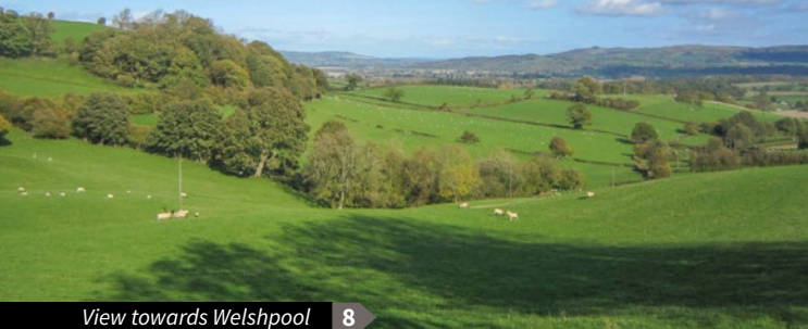
View towards Welshpool 8